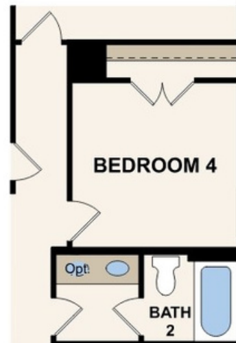
OPT. BEDROOM 4 ILO LOFT