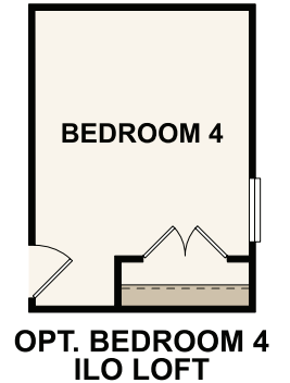
OPT. BEDROOM 4 ILO LOFT