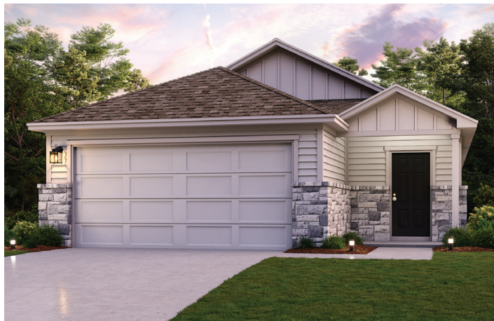
ELEVATION B WITH STONE