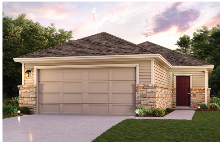
ELEVATION B WITH STONE