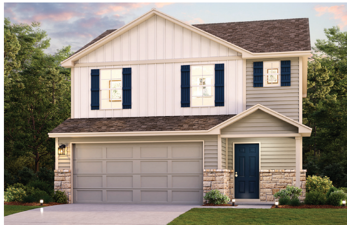
ELEVATION B WITH STONE