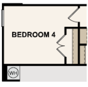
OPT. BEDROOM 4