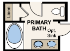
OPT. PRIMARY BATH GARDEN TUB