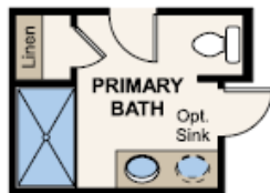
OPT. PRIMARY BATH WALK-IN SHOWER