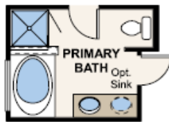
OPT. PRIMARY BATH TUB & SHOWER