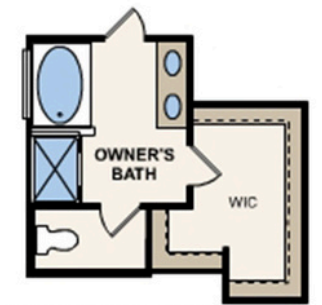
OPT. OWNER'S BATH TUB & SHOWER

CenturyCommunities.com/TheOaks | 629.219.2082