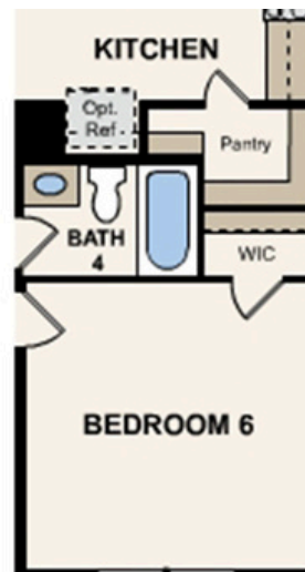
OPT. BEDROOM 6/ BATH 4