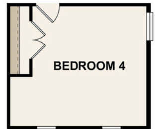
OPT. BEDROOM 4