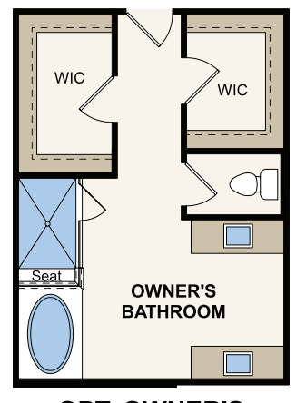
OPT. OWNER'S TUB/SHOWER