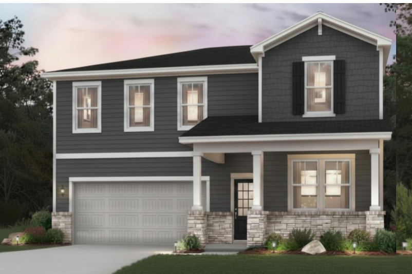
C2 Elevation Color Package 6