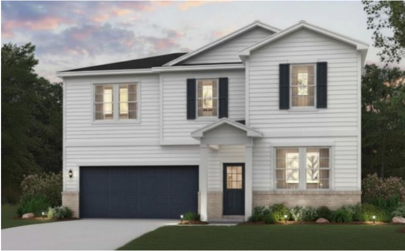
A2 Elevation Color Package 16

2,774 square feet | 4 BR | 2.5 Baths | 2 Bay