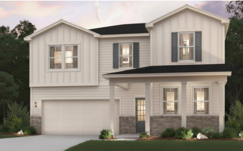
B2 Elevation Color Package 5