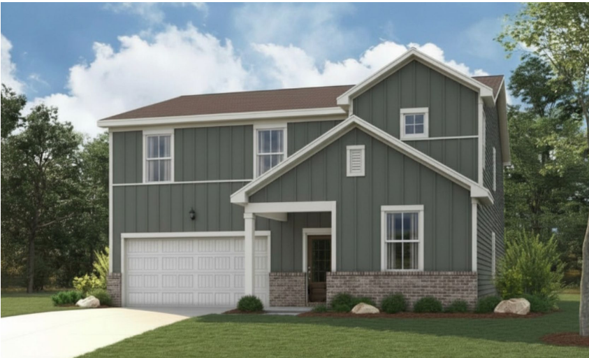
B2 Elevation Color Package 7