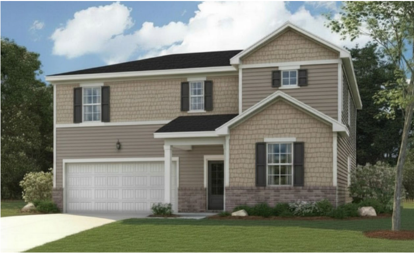
A2 Elevation Color Package 2

2,802 square feet | 4 BR | 2.5 Baths | 2 Bay