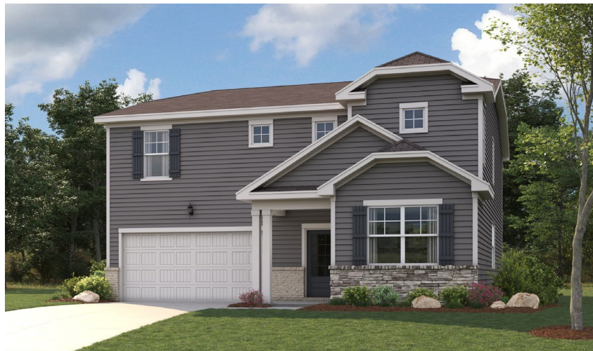
C2 Elevation Color Package 5