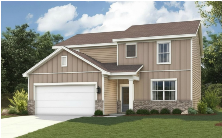
B2 Elevation Color Package 1