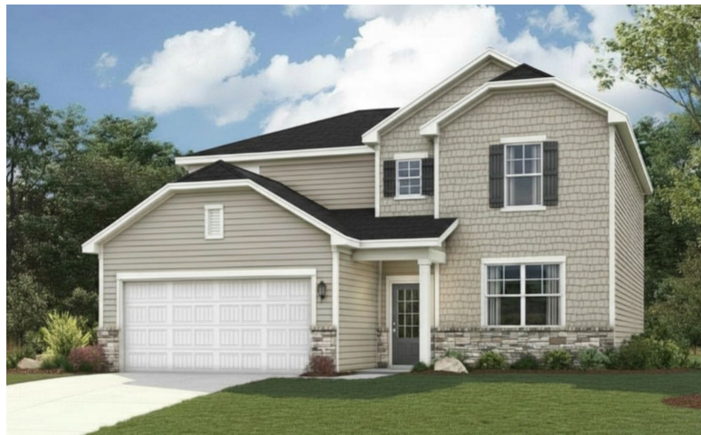
C2 Elevation Color Package 5