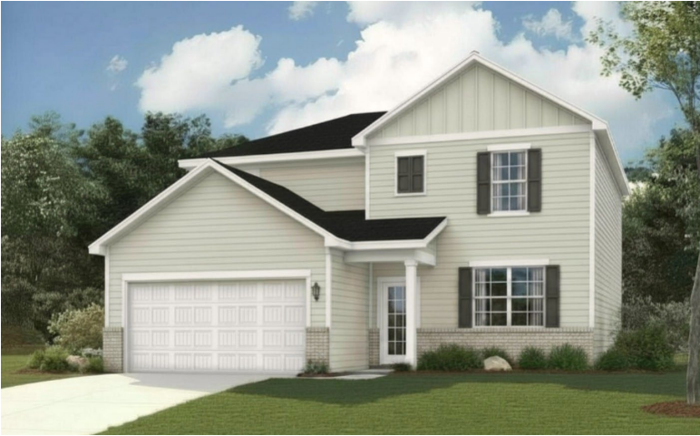
A2 Elevation Color Package 16

2,410 square feet | 3 BR | 2.5 Baths | 2 Bay