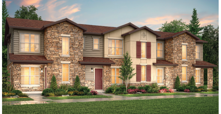
4 PLEX - ELEVATION A