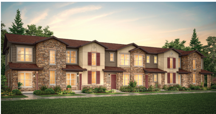
6 PLEX - ELEVATION A