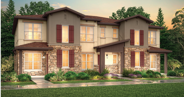
3 PLEX - ELEVATION B

APPROX. 1,373 SQ. FT. | 2-STORY | 3 BEDROOMS | 2.5 BATHROOMS | 2-BAY GARAGE