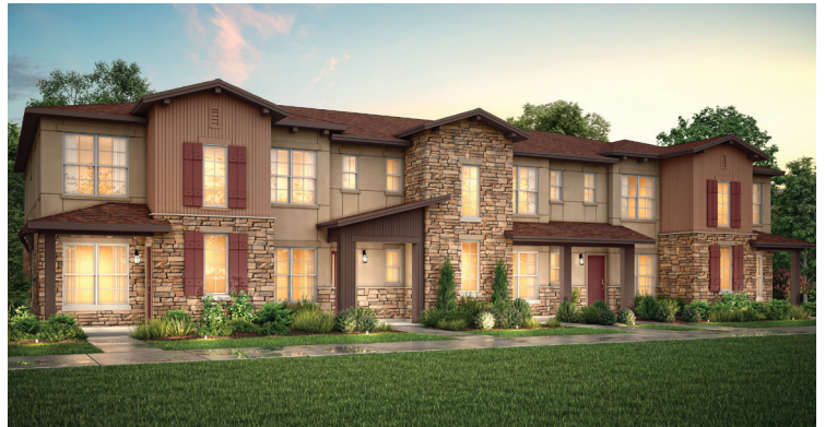
5 PLEX - ELEVATION B