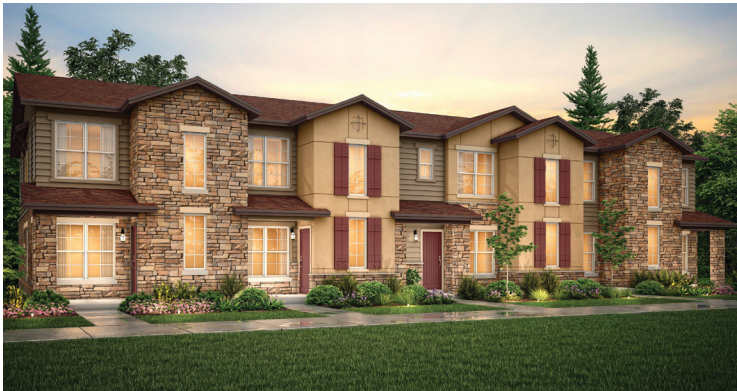
5 PLEX - ELEVATION A