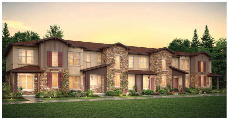
6 PLEX - ELEVATION B