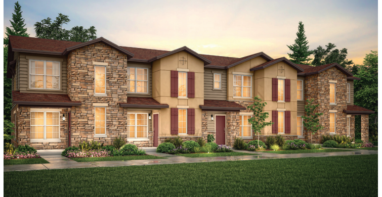
5 PLEX - ELEVATION A