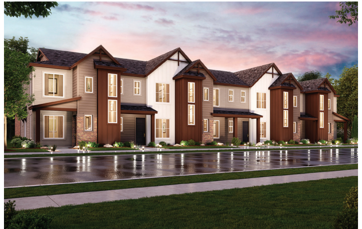
ELEVATION B - 6 PLEX