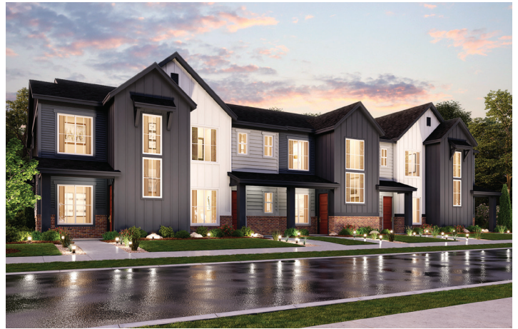
ELEVATION A - 5 PLEX