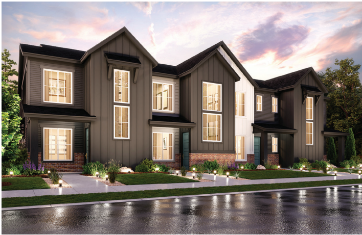
ELEVATION A - 4 PLEX

APPROX. 1,390 SQ. FT. | 2-STORY | 3 BEDROOMS | 2.5 BATHROOMS | 2-BAY GARAGE