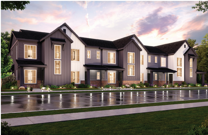
ELEVATION A - 6 PLEX