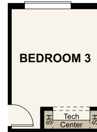
OPT. POCKET OFFICE AT BEDROOM 3