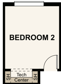
OPT. POCKET OFFICE AT BEDROOM 2