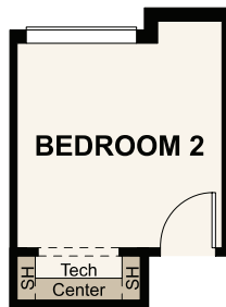
OPT. POCKET OFFICE AT BEDROOM 2