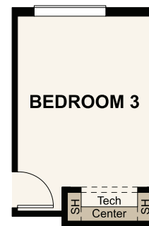
OPT. POCKET OFFICE AT BEDROOM 3