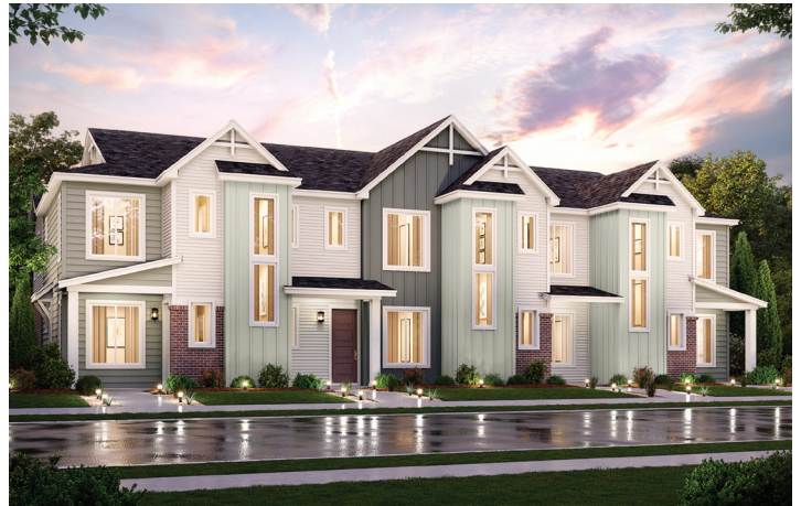
4 PLEX - ELEVATION B