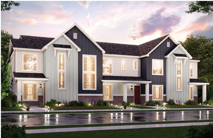
4 PLEX - ELEVATION A