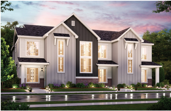
3 PLEX - ELEVATION A

APPROX. 1,378 SQ. FT. | 2-STORY | 3 BEDROOMS | 2.5 BATHROOMS | 2-BAY GARAGE