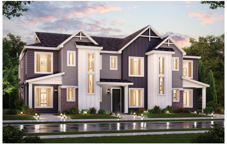
3 PLEX - ELEVATION B