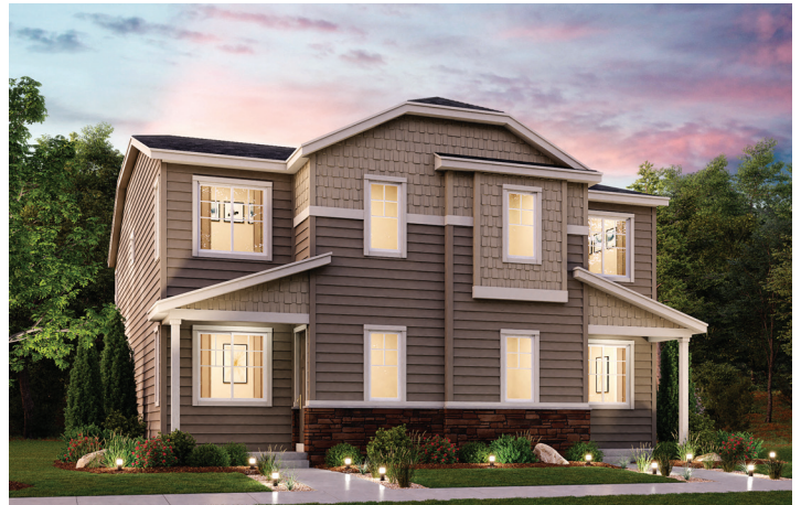
ELEVATION ROCKAWAY B ROCKAWAY B