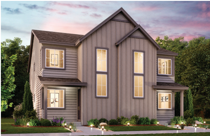
ELEVATION ROCKAWAY A ROCKAWAY A

APPROX. 1,432 SQ. FT. | 2-STORY | 3 BEDROOMS | 2.5 BATHROOMS | 2-BAY GARAGE