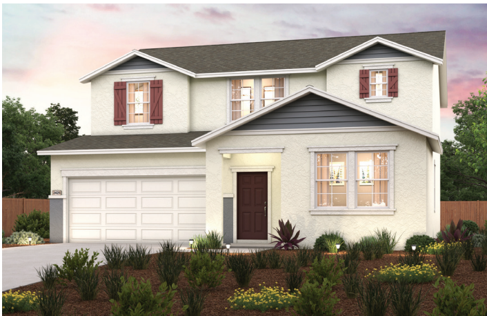
ELEVATION C - COTTAGE