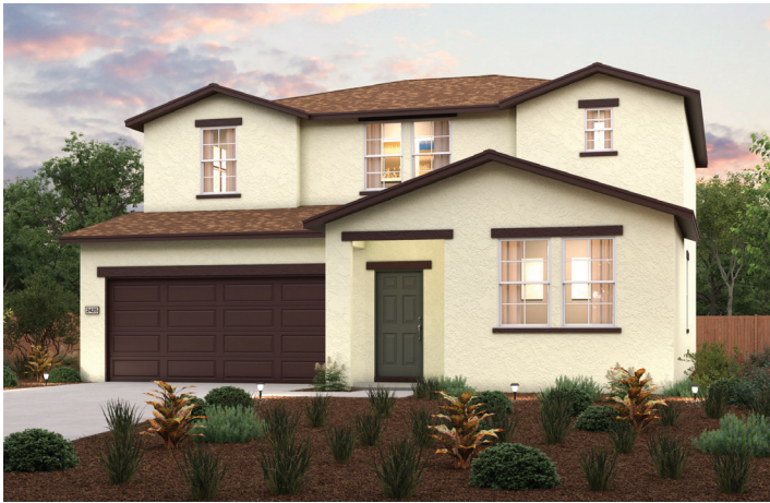
ELEVATION A - EARLY CALIFORNIA

APPROX. 2,454 SQ. FT. | 2-STORY | 4 BEDROOMS | 3 BATHROOMS | 2-BAY GARAGE