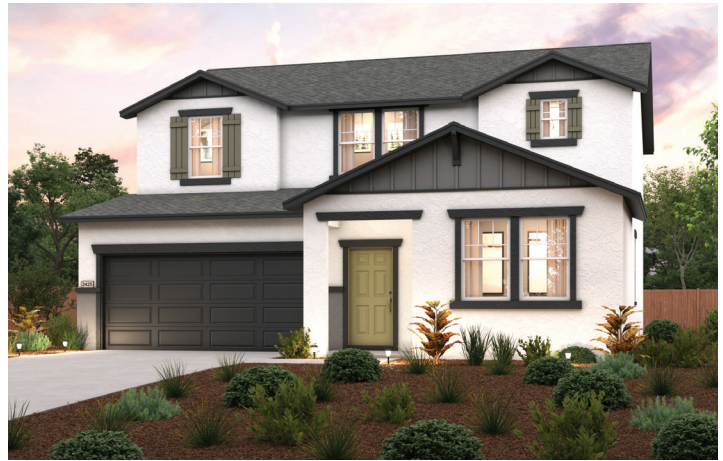
ELEVATION B - BUNGALOW