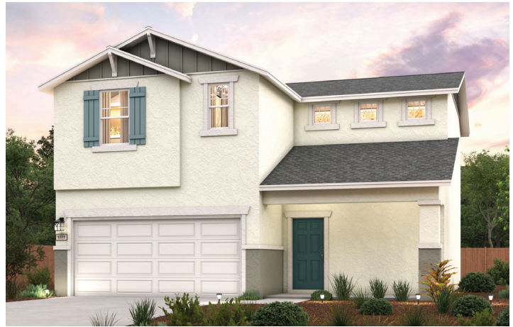
ELEVATION B - BUNGALOW