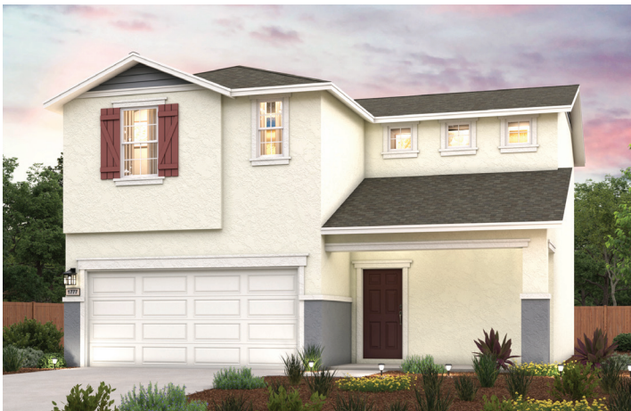
ELEVATION C - COTTAGE