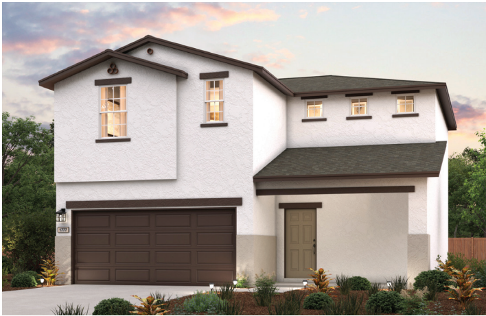
ELEVATION A - EARLY CALIFORNIA

APPROX. 1,777 SQ. FT. | 2-STORY | 3 BEDROOMS | 2.5 BATHROOMS | 2-BAY GARAGE