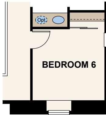
OPT. BEDROOM 6