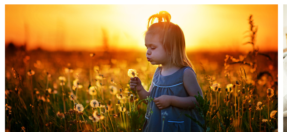
THE FRASER RESIDENCE 36204