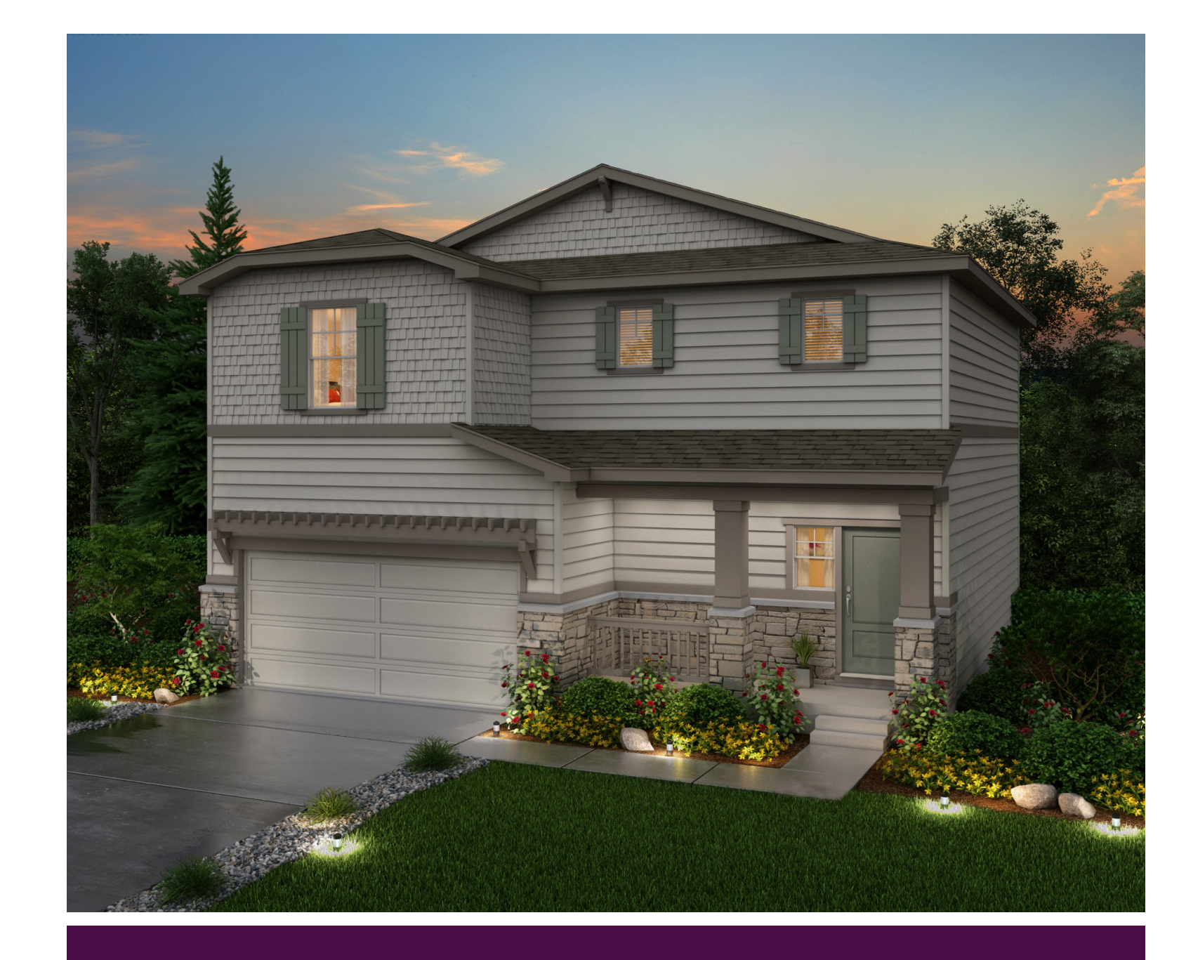
ENCLAVE AT PINE GROVE