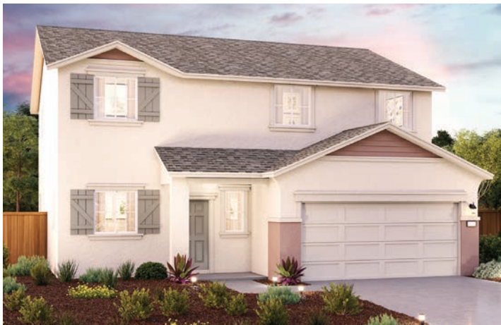
ELEVATION C - COTTAGE