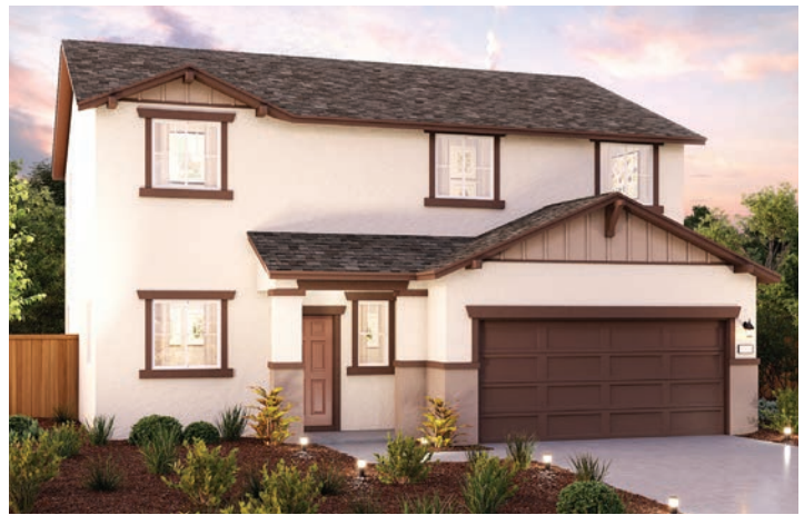
ELEVATION B - BUNGALOW