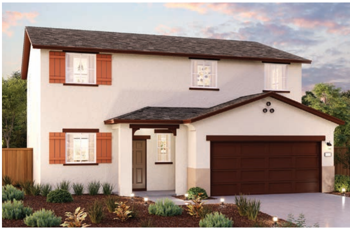
ELEVATION A - EARLY CALIFORNIA

APPROX. 2,222 SQ. FT. | 2-STORY | 5 BEDROOMS | 3 BATHROOMS | 2-BAY GARAGE