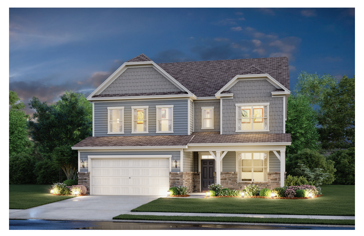
Ashby II C