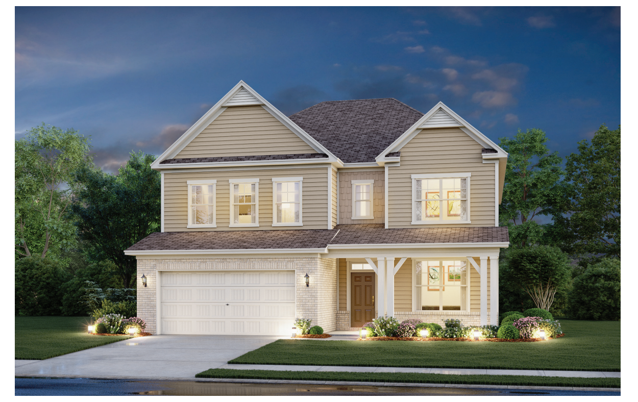
Ashby II B