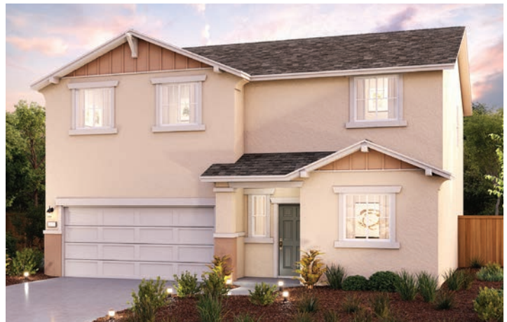
ELEVATION B - BUNGALOW