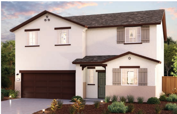
ELEVATION A - EARLY CALIFORNIA

APPROX. 2,096 SQ. FT. | 2-STORY | 5 BEDROOMS | 3 BATHROOMS | 2-BAY GARAGE