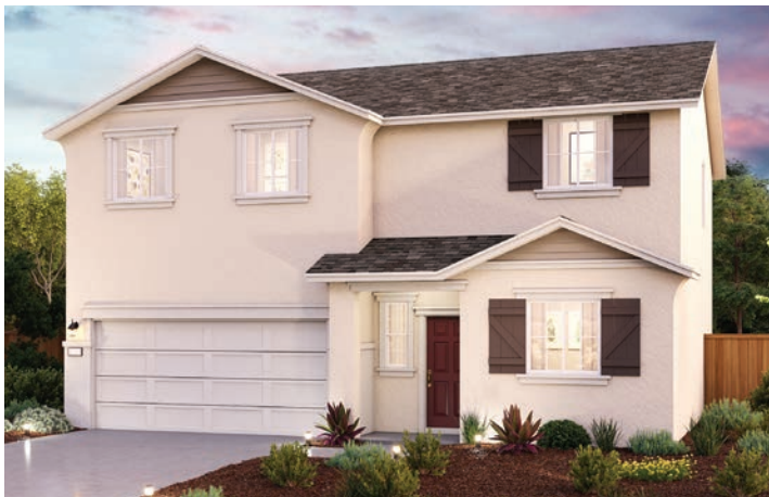
ELEVATION C - COTTAGE