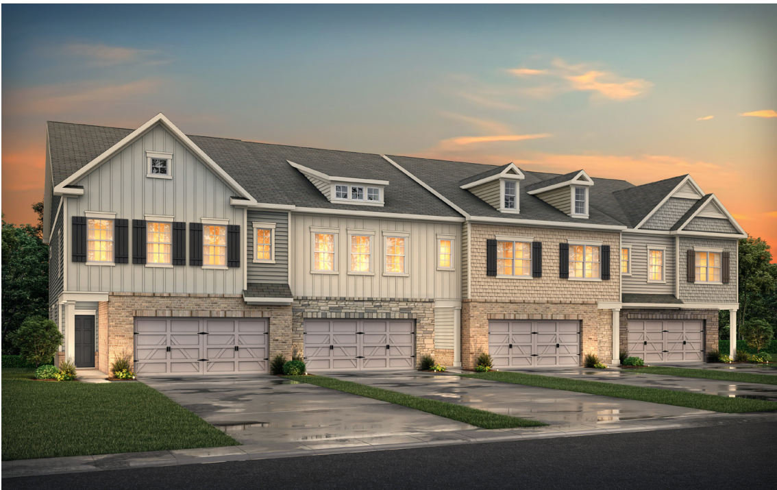
HAYES ELEVATION C