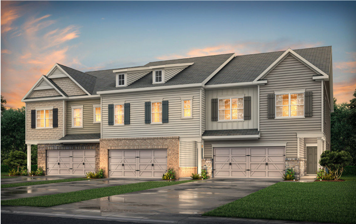
HAYES ELEVATION B