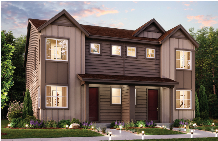
ELEVATION WESTPORT A WESTPORT A

APPROX. 1,386 SQ. FT. | 2-STORY | 3 BEDROOMS | 2.5 BATHROOMS | 2-BAY GARAGE