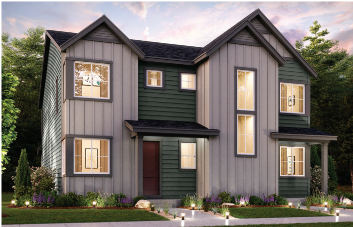
ELEVATION WESTPORT A ROCKAWAY A