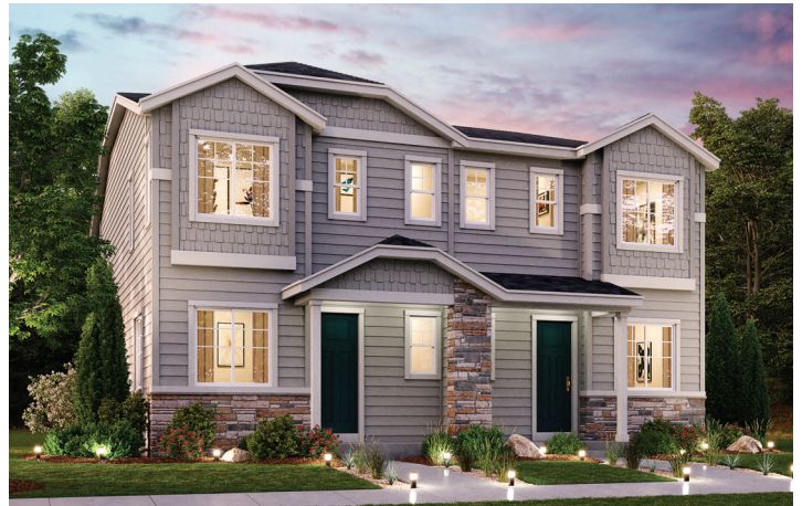
ELEVATION WESTPORT B WESTPORT B