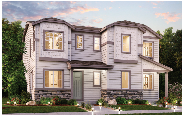
ELEVATION WESTPORT B ROCKAWAY B