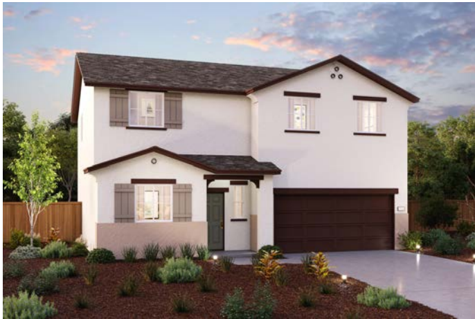
ELEVATION A - EARLY CALIFORNIA

APPROX. 2,096 SQ. FT. | 2-STORY | 5 BEDROOMS | 3 BATHROOMS | 2-BAY GARAGE