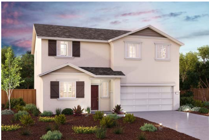
ELEVATION C - COTTAGE