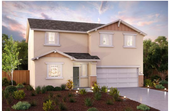
ELEVATION B - BUNGALOW