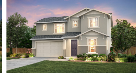
Early California Americana Bungalow