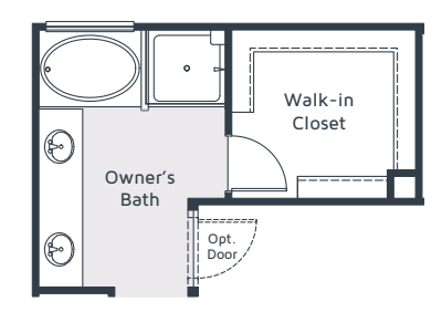
OPT. TUB & SHOWER AT OWNER'S BATH