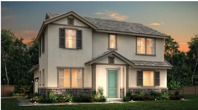
ELEVATION C - COTTAGE