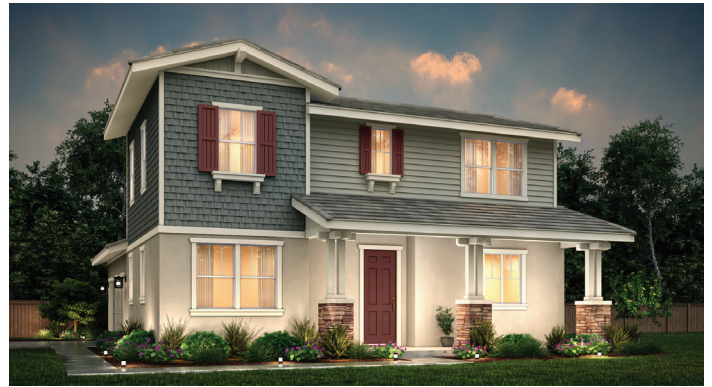
ELEVATION B - CRAFTSMAN