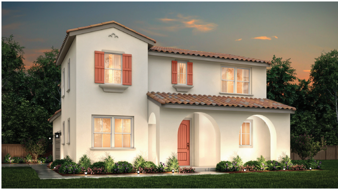
ELEVATION A - MISSION

2,215 SQ. FT. | TWO-STORY | 4 BEDS | 3 BATHS | 2 BAY GARAGE