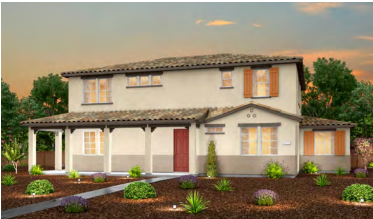
SPANISH - ELEVATION A

2,834 SQ. FT. | TWO STORY | 4 BEDROOMS | 3 BATHROOMS | 4 BAY GARAGE