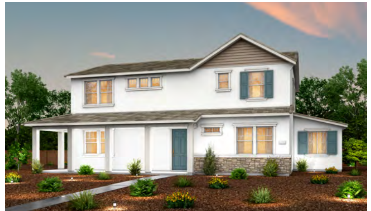
COTTAGE - ELEVATION B