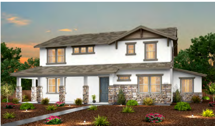
BUNGALOW - ELEVATION C