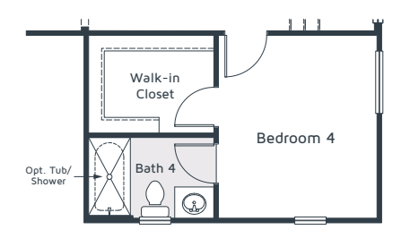
OPT. BEDROOM 4 WITH BATH 4 AT LOFT