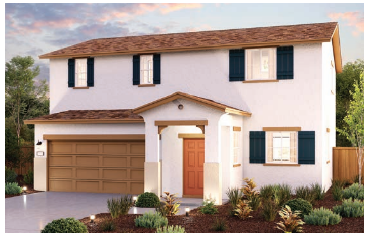
ELEVATION A - EARLY CALIFORNIA

APPROX. 1,839 SQ. FT. | 2-STORY | 4 BEDROOMS | 3 BATHROOMS | 2-BAY GARAGE