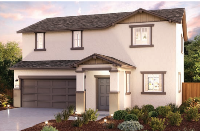
ELEVATION B - BUNGALOW