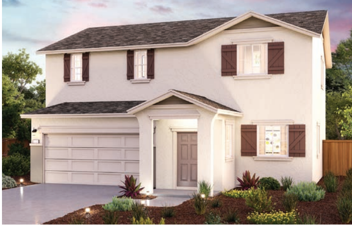
ELEVATION C - COTTAGE