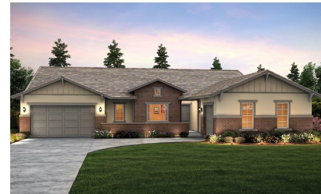
Elevation B - Bungalow