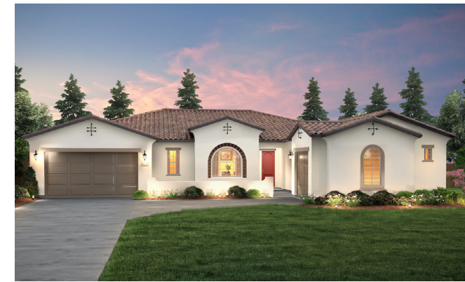
Elevation A - Spanish