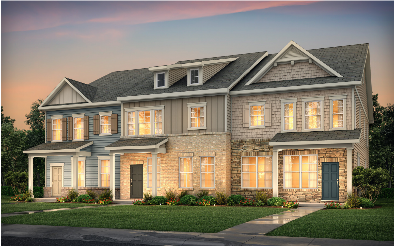
CAMERON ELEVATION A