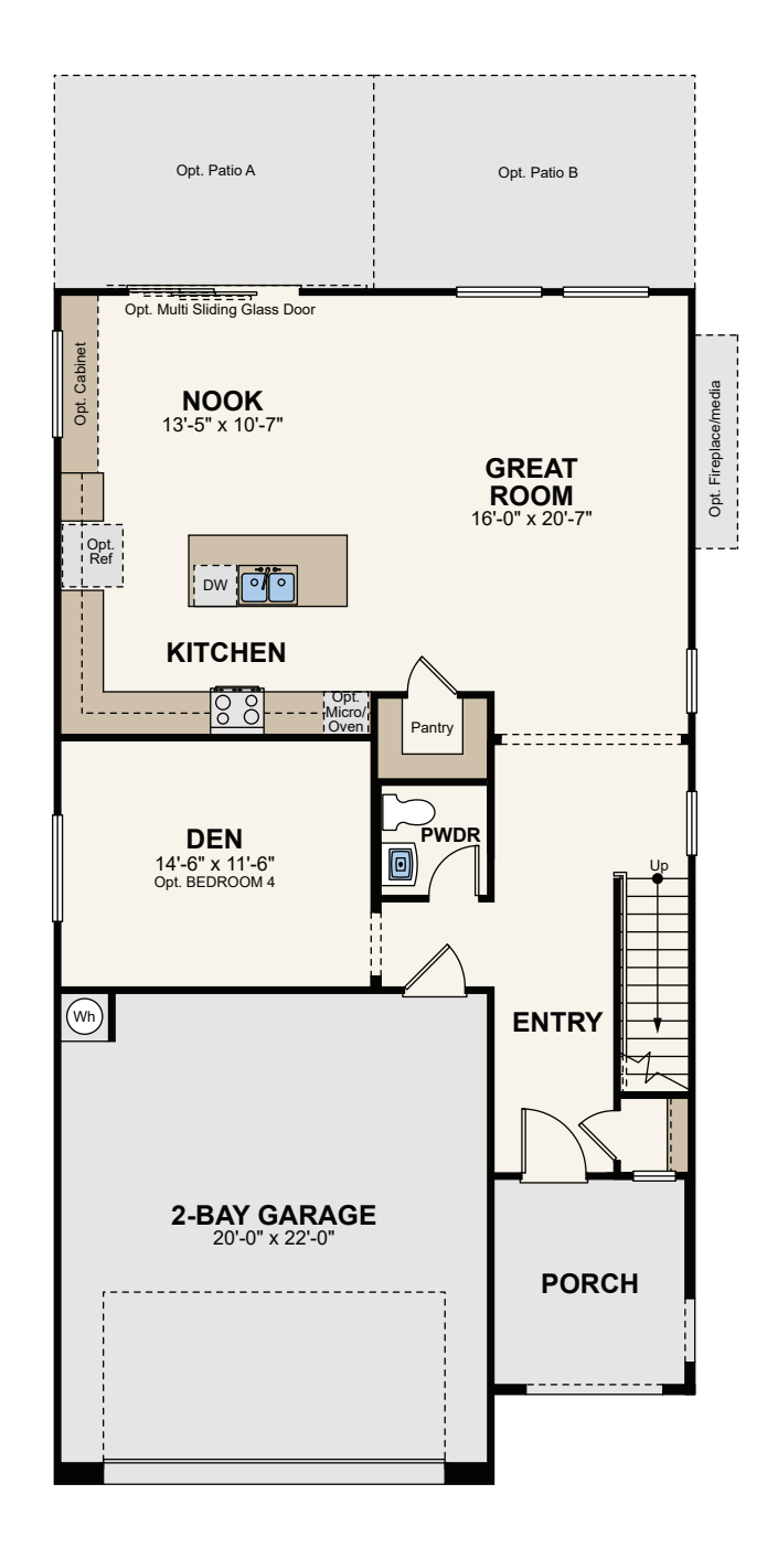
FIRST FLOOR PRELIMINARY