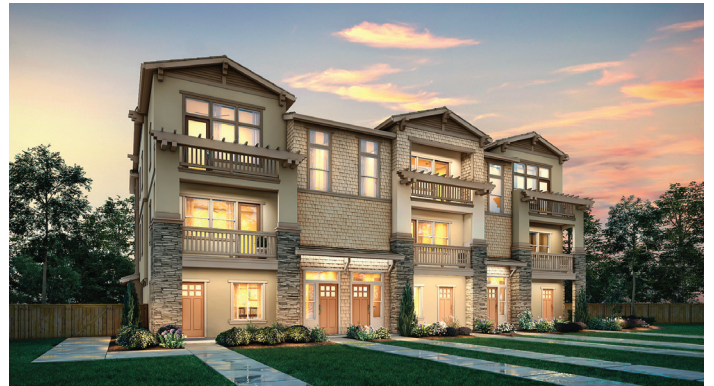
FLAT A 6 PLEX