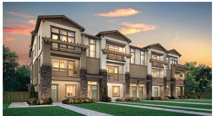
FLAT A 8 PLEX