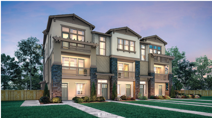
FLAT A 5 PLEX

1,496 SQ. FT. | TWO-STORY TOWNHOME-STYLE CONDO | 2 BEDROOMS | 2.5 BATHROOMS | 1 BAY GARAGE | ELEVATOR