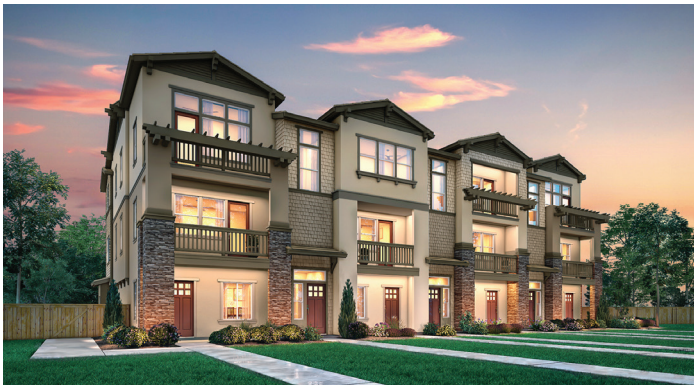
FLAT A 7 PLEX