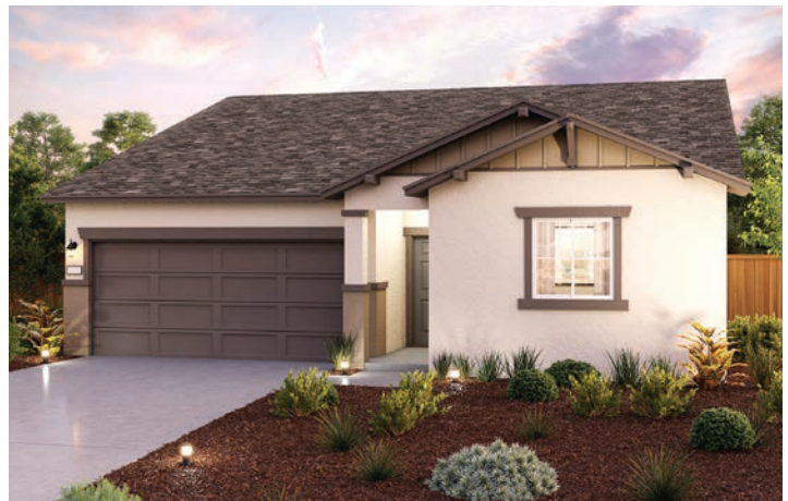
ELEVATION B - BUNGALOW