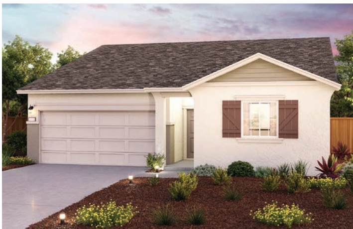
ELEVATION C - COTTAGE