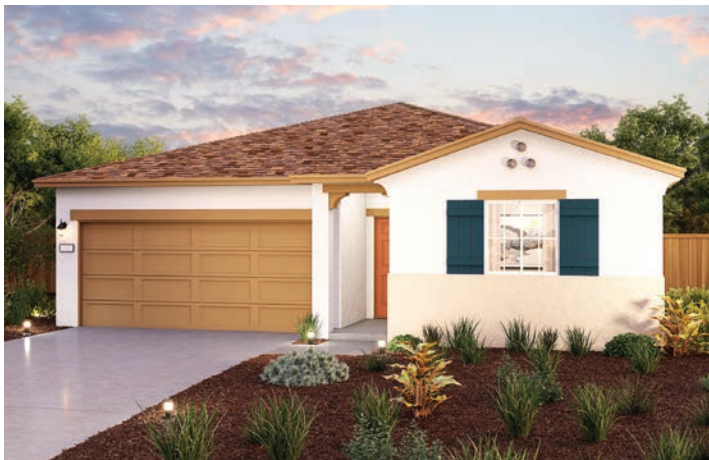
ELEVATION A - EARLY CALIFORNIA

APPROX. 1,717 SQ. FT. | 1-STORY | 4 BEDROOMS | 2 BATHROOMS | 2-BAY GARAGE