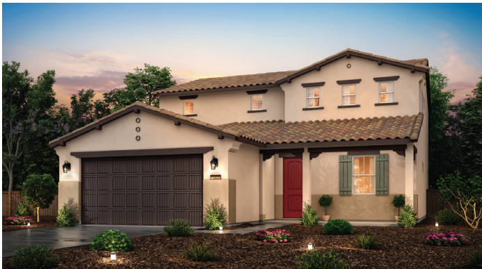
ELEVATION A - MISSION

2,528 SQ. FT. | TWO-STORY | 3 BEDROOM | 2.5 BATHROOMS | 2 BAY GARAGE OPTIONAL: COVERED PATIO | BEDROOM 5, BATH 3 AT DEN | RETREAT AT BEDROOM 2 | OWNERS TUB AT OWNERS BATH | BEDROOM 4 AT LOFT | 3 BAY GARAGE