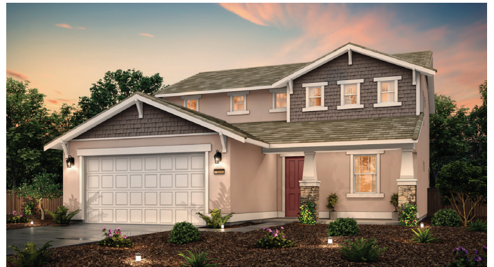
ELEVATION B - CRAFTSMAN