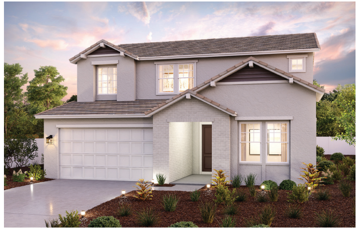
COTTAGE ELEVATION C