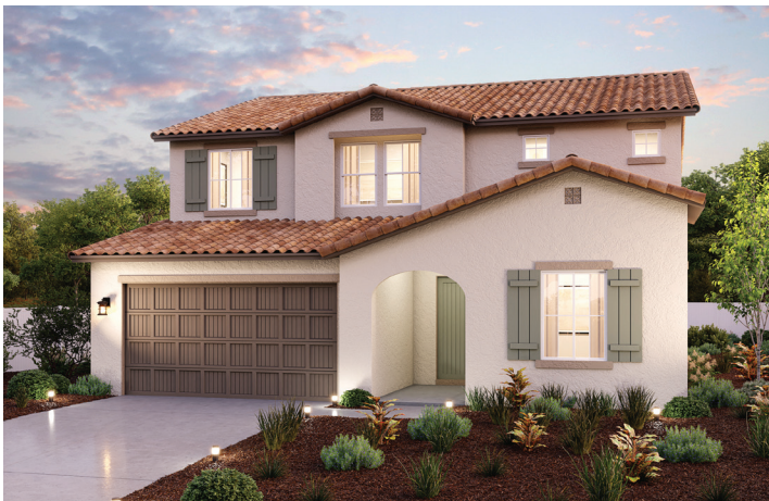
SPANISH COLONIAL ELEVATION A