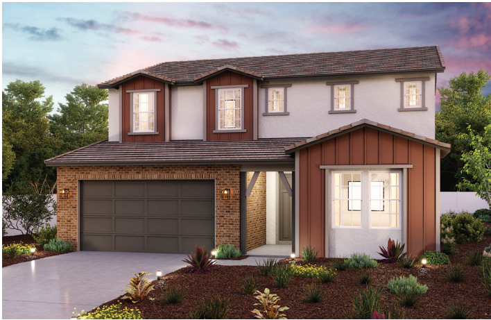
CALIFORNIA RANCH ELEVATION D

APPROX. 2,952 SQ. FT. | 2-STORY | 5 BEDROOMS | 4 BATHROOMS | OFFICE | 3-BAY GARAGE LOFT | LAUNDRY ROOM WITH SINK