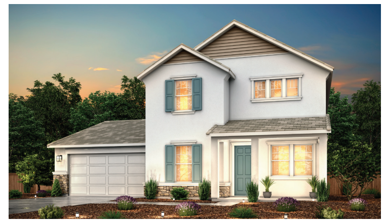
COTTAGE - ELEVATION B