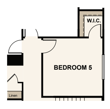
OPT. BEDROOM 5 @ LOFT