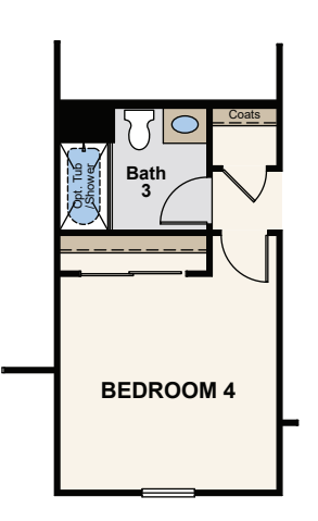
OPT. BEDROOM 4 @ DEN